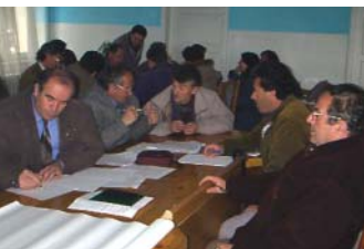
Left: decentralisation meeting in the pilot region (Elbasan)