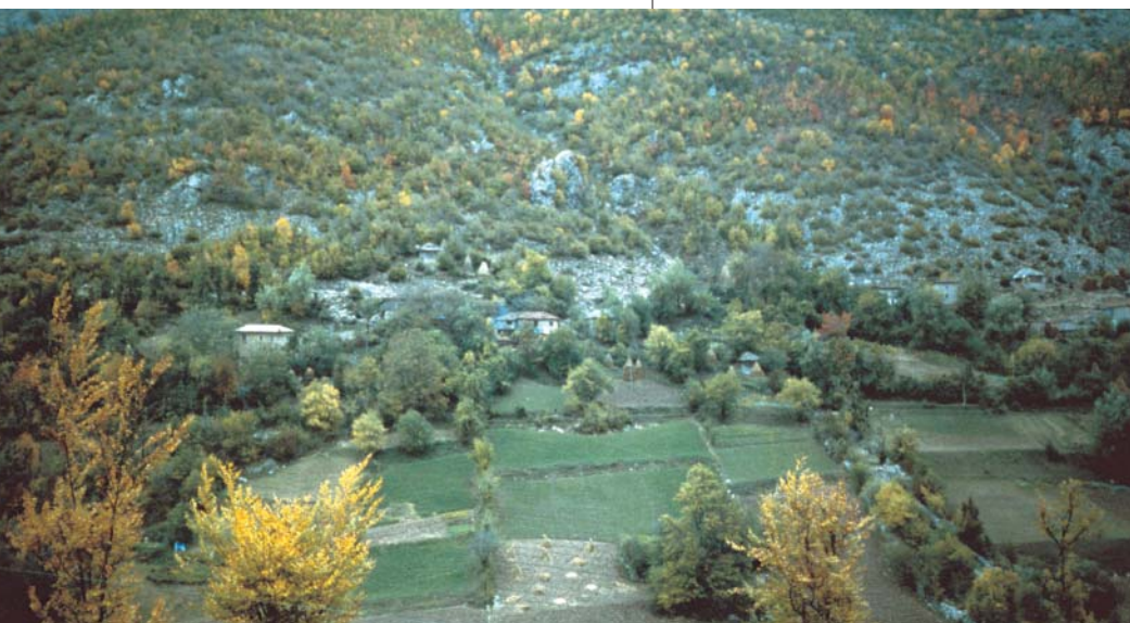
Albanian hill farm in the rugged and mountainous eastern district of Peshkopi