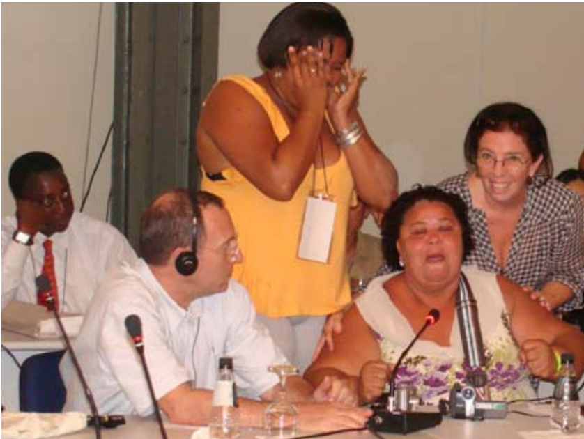
Delight as Brazil government authorities announce the planned regularization of Santo Amaro at the World Urban Forum.

The Brazilian Government recently announced that it would not evict around 55,000 people from their homes in Santo Amaro.