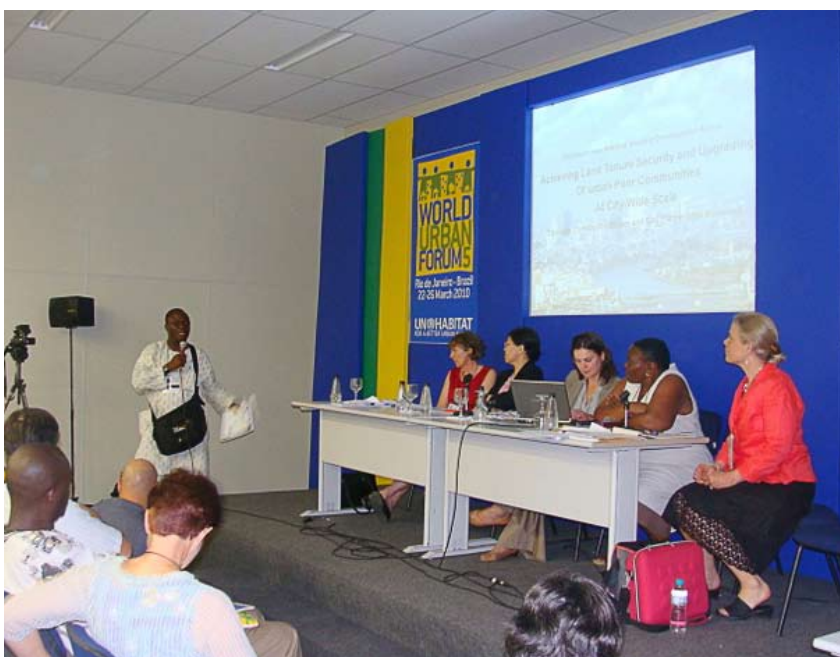
A participant expressing his views during the WUF Networking Event "Count me in, in planning my city" 23 March 2010