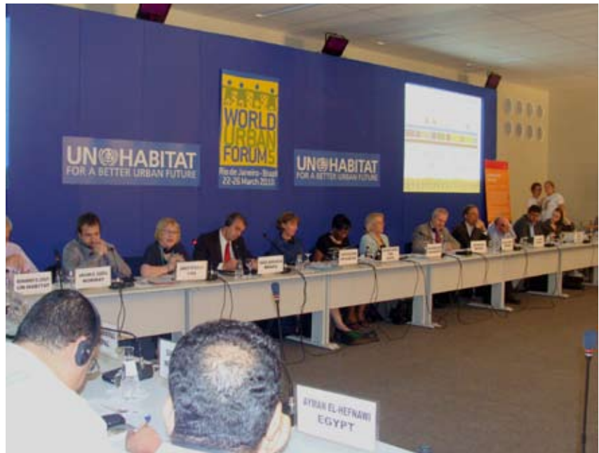
Discussions during the Roundtable on Piloting a GLTN Land Tool, 25 March 2010. Rio De Janeiro, Brazil 2010

Through the pilots, women and Through the pilots, women and grassroots organizations from three countries, Brazil, Ghana and Nepal have gained the