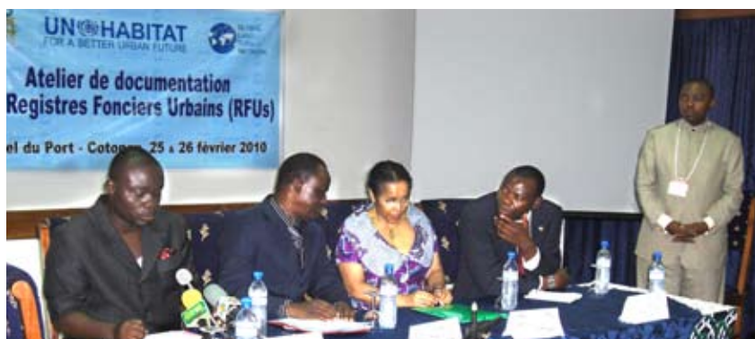
Opening programme of the workshop on Urban land registry, Cotonou, Benin 26 February 2010.

All information on the RFU including the report of the workshop, the report of the documentation process, the film on RFU and photo documentation, once finalized will be posted on GLTN's website.