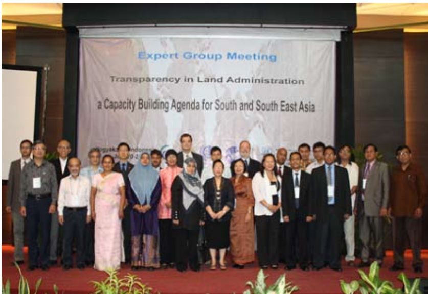
Participants of the EGM on Transparency in Land Administration : A Capacity Building Agenda for South and South East Asia, Jogjakarta, Indonesia, 20-21 July 2010.

In preparation for the upcoming training events on Transparency in Land Administration (TLA) in South and South East Asia, about twenty-five land experts representing the academia, professional groups, members of civil society and government authorities participated in the Expert Group Meeting (EGM) in Yogyakarta, Indonesia on 20-21 July 2010. The meeting culminated by outlining the next steps and way forward of the capacity building agenda for South and South East Asia through the conduct of two training events related to transparency in land administration.