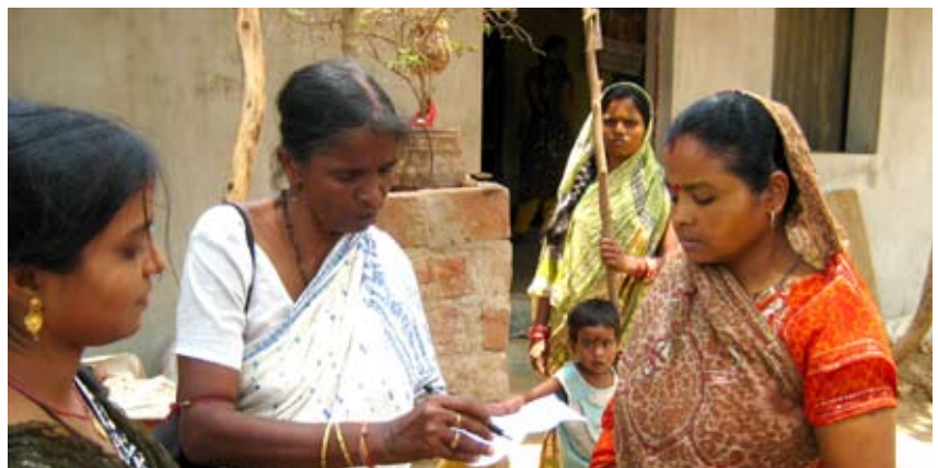
Mapping team explains the boundary mapping to Mahilan Milan leaders, Orissa, India.

A workshop was held in November 2009 focused on the second function – scaling-up community-led initiatives – as a first step in implementing the Grassroots Mechanism strategy. This has led to the support of four projects in early 2010 implemented by grassroots organizations affiliated to one of the GLTN partners. Outputs include communication materials to facilitate replication and independent documentation to build understanding and confidence among state actors and donors.