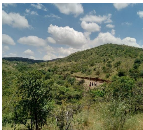
Picture 2: Reserved highland grazing areas for dry season for Paka rangelands

In both countries, the communities have been able to secure the grazing lands for both dry and wet seasons. Notably, the legal demarcation of grazing and farming lands in Tanzania has ensured a sustainable approach to co-existence between pastoralist and agro-pastoralist communities in the four clusters 6 .