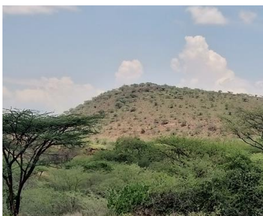
Picture 1: Lowland grazing areas during wet season for Paka rangelands

Based on the contribution analysis, the project is making sound progress towards the secure and sustainable use of rangelands by the pastoral communities. Picture 1 and Picture 2 show the significant difference in the rangelands reserved by the management structures during wet season and during dry season. As a result, the communities within Paka hills in Kenya have managed to secure their grazing lands throughout the year.