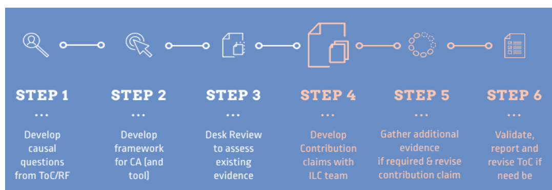
Figure 1: Summary of the PRM Contribution Analysis methodology

MDF adopted a methodology integrating two approaches from ILC and MDF in conducting the CA. This approach was further refined in consultative meetings held with ILC and the PRM Steering Committee. The methodology was grounded on a mixed methods approach and implemented through six steps as shown in Figure 1. This methodology was further discussed and agreed upon by the project lead (ILC) and partners – RECONCILE and TNRF – during a consultative online session.